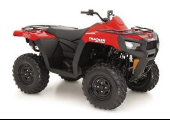
Recalled 2022 Tracker 600 All-Terrain Vehicle